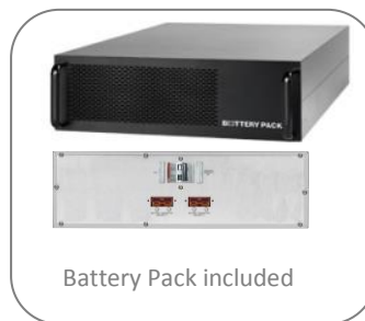
Battery Pack included